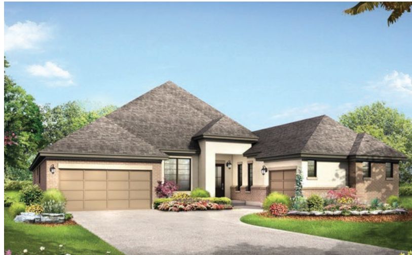
STYLE C - 3408 SQ.FT.