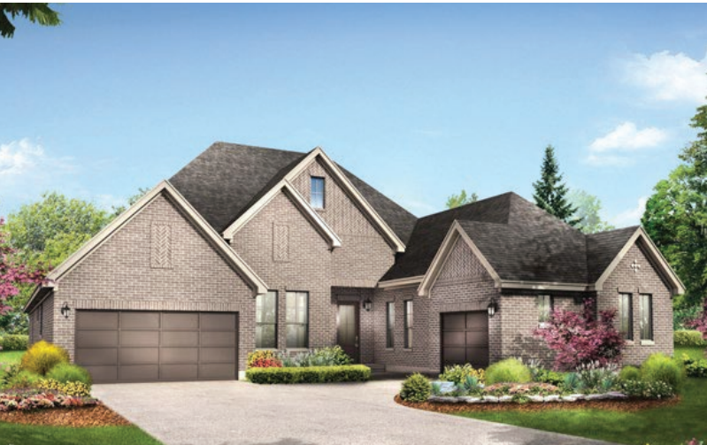
STYLE B - 3408 SQ.FT.