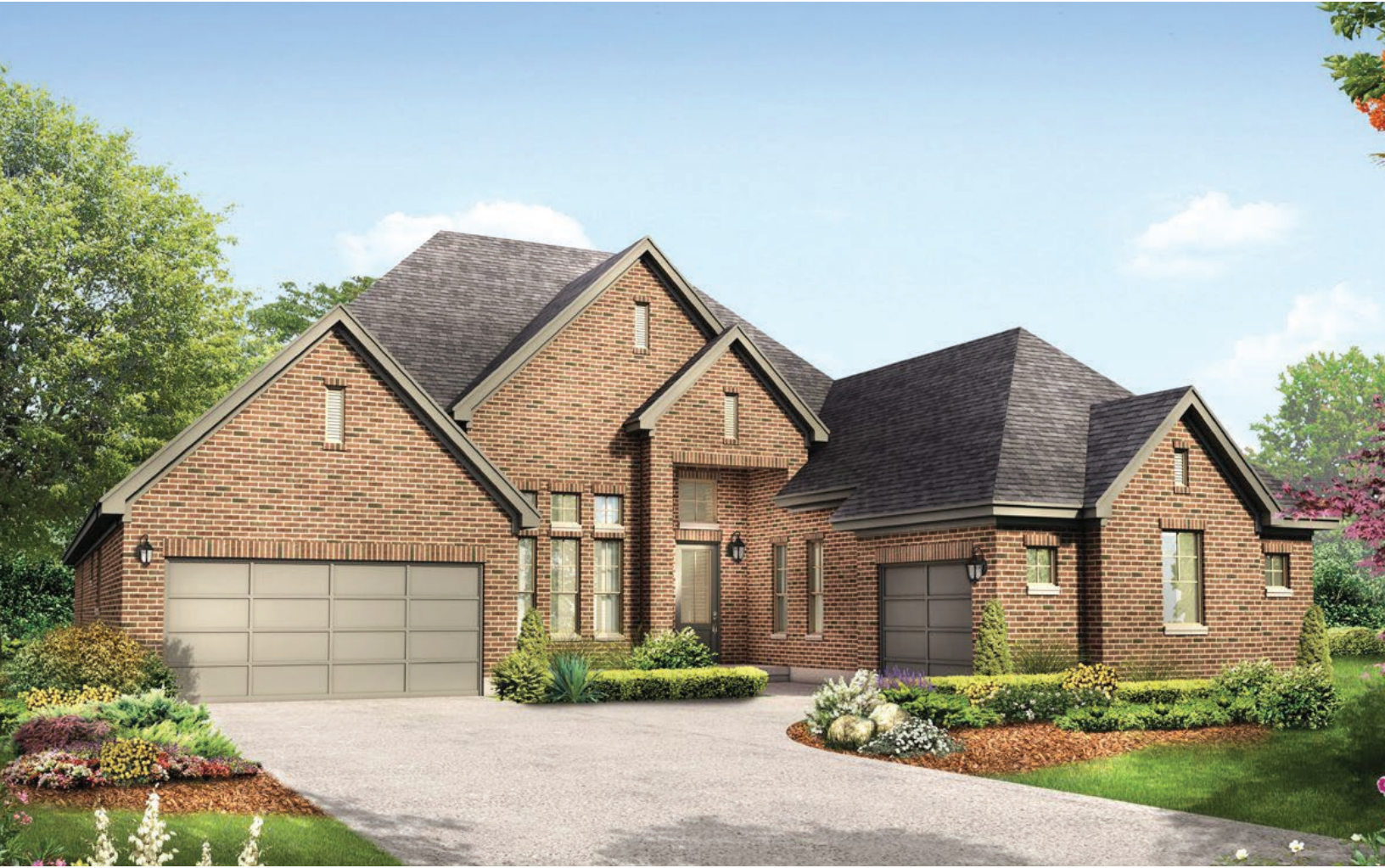
STYLE A - 3408 SQ.FT.