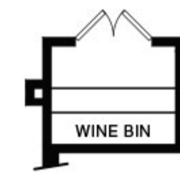
OPTIONAL WINE BIN STYLE A